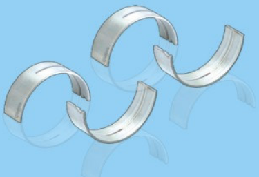
Thinwall Bearings for Hino Engines