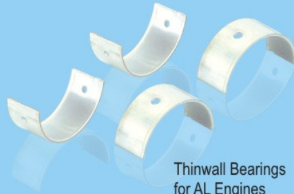
Thinwall Bearings for AL Engines