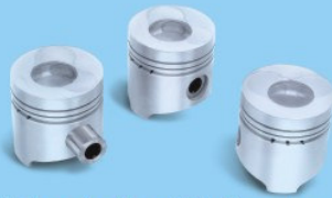
Pistons for Hino 6E / 4D engines