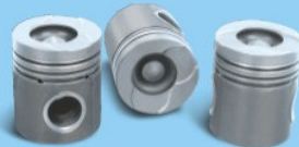
Pistons for AL - 412 engines