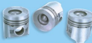
Pistons for Hino BS2 engines