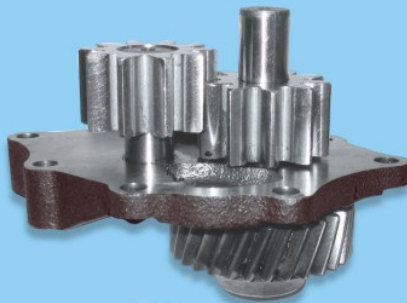
Oil Pump Assembly for Hino engines