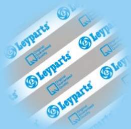
Tie Rod End Kits for all AL vehicles