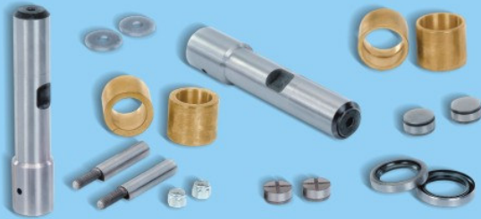
King Pin Kits for all AL vehicles