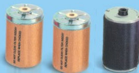
Cloth type and Paper coil type Fuel Filters for AL and Hino engines