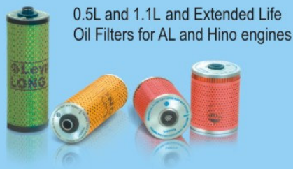
0.5L and 1.1L and Extended Life Oil Filters for AL and Hino engines