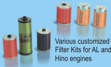
Various customized Filter Kits for AL and Hino engines