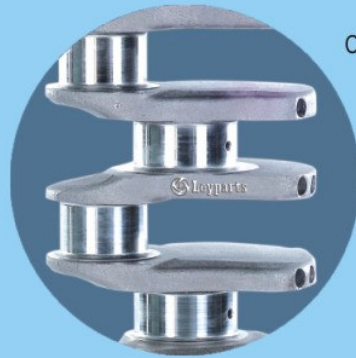
Crankshafts for all Hino engines